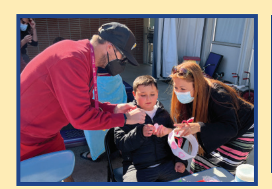
Core Value of Teamwork

how we live them out in our hiring decisions, our training, our promotions, and how we work with each other and those we serve every day. On a go forward basis, we will continue to ask our staff and community for feedback on how well we are living up to our core values as well as how well our core values help us meet the needs of our community. -J.D.