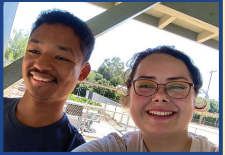
Core Value of Respect

Each day, staff have opportunities to live out our core values with students and adult clients. Our recent Science Camp is a great example of staff supporting students during activities, hanging out together and having fun, and being encouraging while learning a new skill.