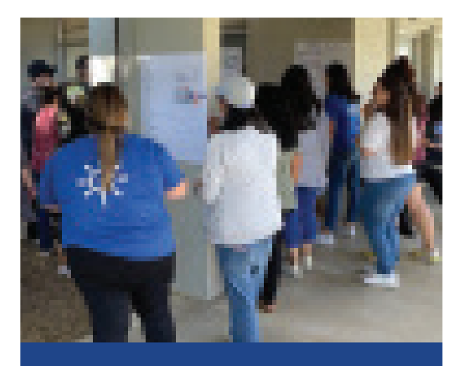
COMMUNICATE AND COLLABORATE: Staff collectively created their top 10 core values eventually choosing Morgan Autism Center's 3 core values of Teamwork, Love, and Respect.

We believe that our core values are a guide for not just us as individuals and as an organization but also for others in how to best serve those with autism and other developmental disabilities. The QR code link below takes you to a deeper description of what it looks like to live our core values with each other and our community. Because of the importance of our deep ties to our community, we want your feedback on these core values and how we live them here at the Morgan Center every day.